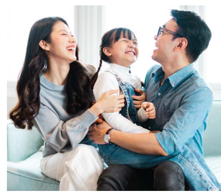
*Peso Intensify! plan provides coverage until age 85, which exceeds the average life expectancy in the Philippines of 70.4 years old based on World Health Organization (WHO) data.

It provides increasing guaranteed cash payouts every 3 years starting on your 10th policy year until 22nd policy year. It allows you to accelerate your savings by providing yearly level cash payout starting on the 25th until 30th policy year, plus 110% maturity benefit by the time you turn 85 years old, providing you a continuous scheduled income through your advancing years.